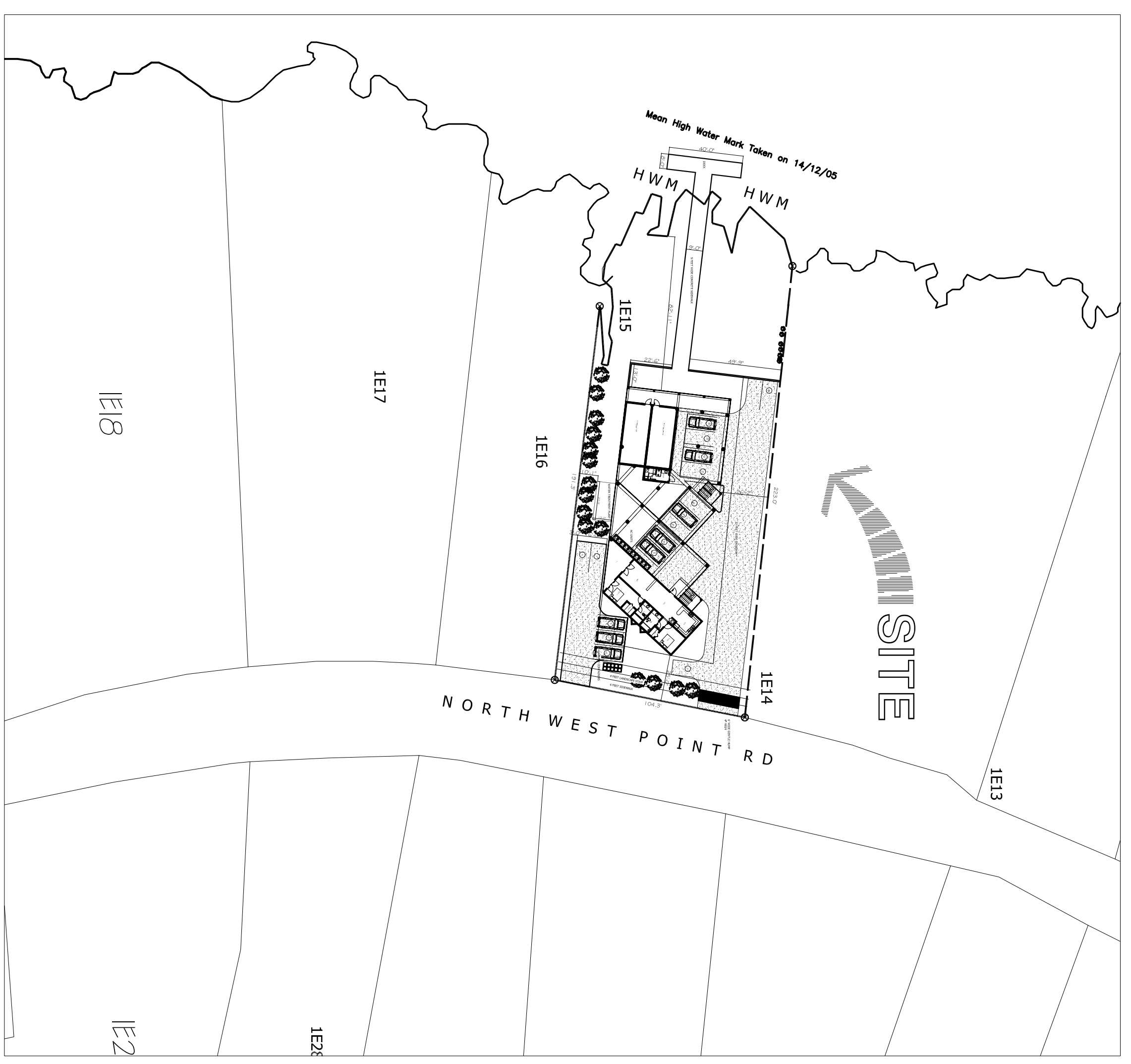
A | 1 | VICINITY MAP 1:01 NOT TO SCALE